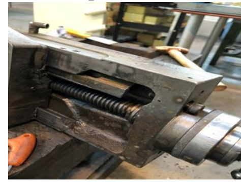
【 Wear condition of the tool post feed table section 】