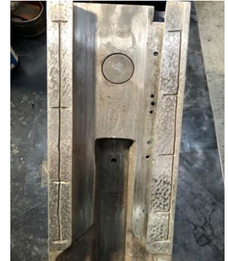
【 Scraping of the feed table slide section 】