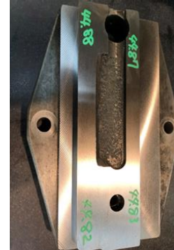
【 Correction of steps by grinding 】

【 Key points of the exchange operation : If the wear is so excessive that it cannot be corrected by the kisage (Scraping) process, a grind process can be performed. 】