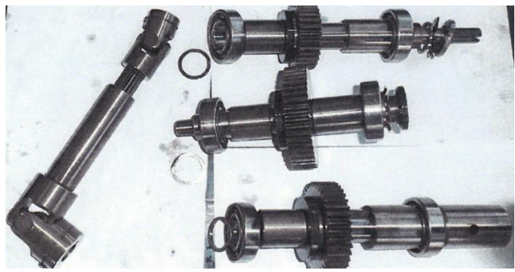
[Bearings and their components]

* 【Key points of the exchange operation :Inspect for shaft & component, damage in various parts, replace bearings】