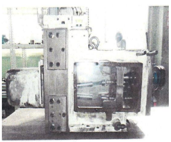
[Interior view when the side cover of the machine is removed.]

* 【Key points of the exchange operation :Inspect for shaft & component, damage in various parts, replace bearings】