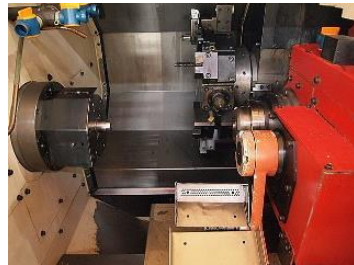
【Overall view of the machine】