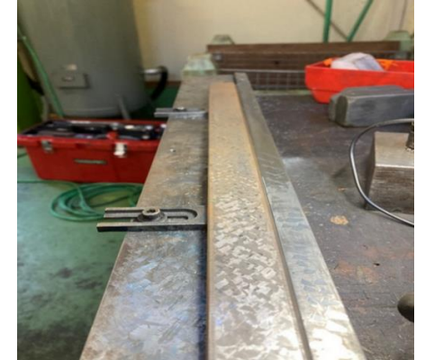
【Newly created gibs and scraping processing.】