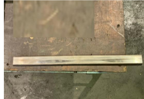
【Condition of the original; worn, step wear 0.5 mm.】