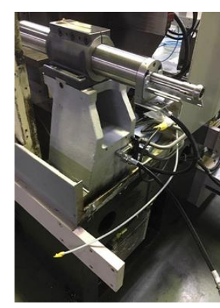
(Mounting of tailstock)