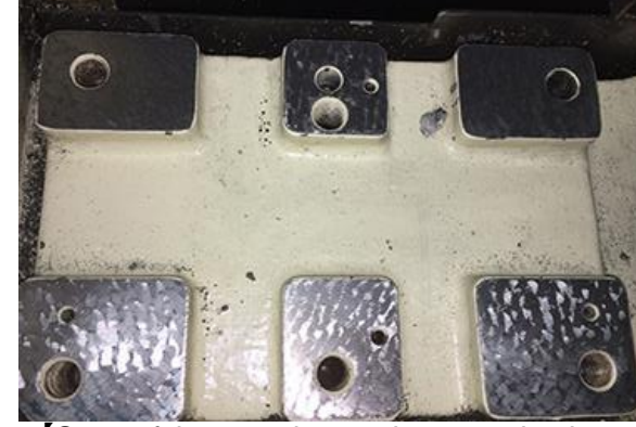
[State of the scraping on the mounting base of the tailstock]

[ Key points of the exchange operation: Electrical and plumbing work included and performed]