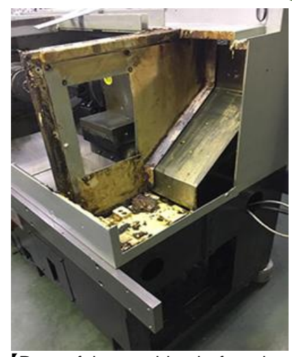
[Rear of the machine before the addition of the tailstock.]

[ Key points of the exchange operation: Electrical and plumbing work included and performed]